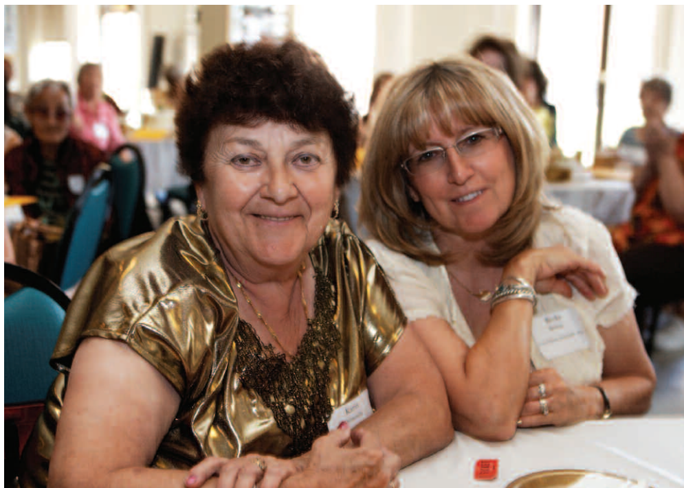
Above: Foster Grandparents are retired seniors who volunteer their time to mentor youth. Below: The Family Volunteer Program provides options for volunteers of all ages to give back. To become a volunteer in any of our programs, call 303-297-0408.

If you already volunteer we thank you from the bottom of our hearts. If you would like to learn more about our organization and how to volunteer please go to www.voacolorado.org .